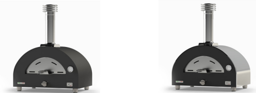
Black Powder Coat Stainless Steel