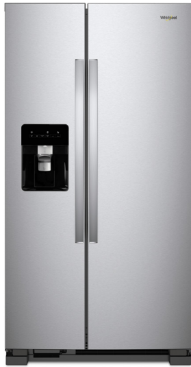
Monochromatic Stainless Steel WRS311SDHM