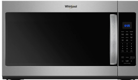
Fingerprint Resistant Stainless Steel WMH32519HZ