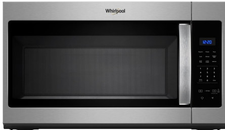
Fingerprint Resistant Stainless Steel WMH31017HZ