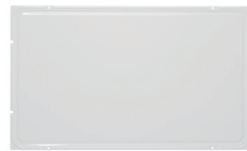
Inner weather panel

Sleeve is shown at right with standard painted steel inner panel, painted steel outer panel and standard grille