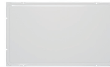
Outer weather panel