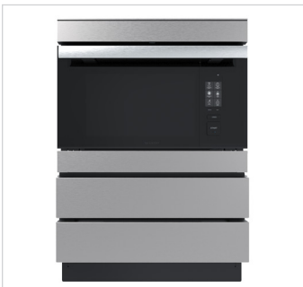
Optional, 2-drawer Under-the-Counter Pedestal accessory simply slides in for hassle-free installation.

Cleanup is a breeze with two, preset cleaning modes. There is even a sterilize option for canning jars, lids and small utensils. The removable reservoir means no special plumbing or wet-wall installation is required. And with a common, 120V power requirement, you can just plug it into a regular outlet and you're ready to go.