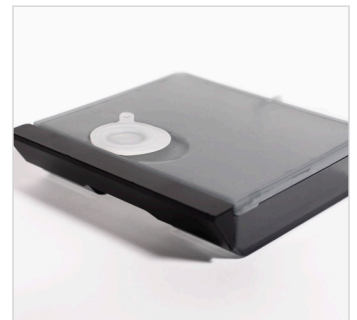
Compact, removable 24 oz. water tank is convenient, lightweight, easy to fill, and easy to access