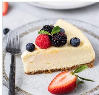
The Water Bath feature is a virtual Bain-Marie for slow-baking custards, cheesecakes, and puddings.