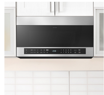
The sleek edge-to-edge stainless steel and black glass design is an elegant look to your kitchen

Product specifications and design are subject to change without notice.