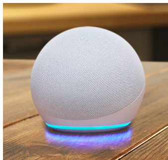
Works with Alexa allows for effortless verbal control over your microwave