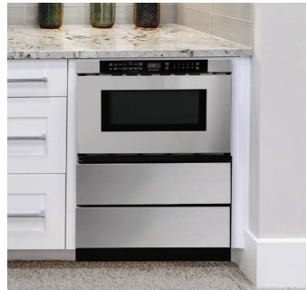
Optional Pedestal Accessory (SKMD24U0ES) Slides Under the Counter for Convenient Installation