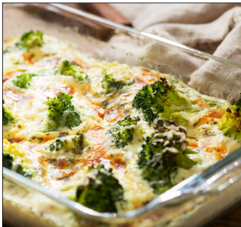
Cooking Space Large Enough for a 4-qt Casserole Dish or a 20 oz. Beverage

The Sharp SMD2440JS Microwave Drawer™ Oven with Sensor Cook features our Easy Touch Automatic Drawer system to gently open the drawer with the touch of a button. Use the same button or give the drawer a small nudge, and it closes smoothly. The even, gliding action and solid construction help prevent liquids from spilling during opening and closing. The SMD2440JS can be wiped with a damp cloth inside and out for quick and easy cleanup. Audible signals can be turned on or off, and the control panel can be locked down to prevent accidental operation by small children and while cleaning. Now that is Simply Better Living.