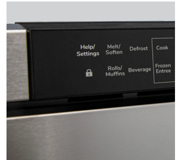
Enable Control Lock to Prevent Accidental Operation