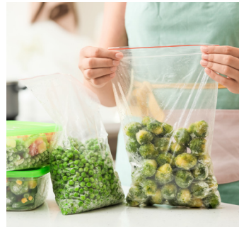
Steamer Bag Preset Easily Steams a Bag of Frozen Veggies up to 17oz