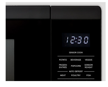
Premium White LED Display is Easy to Read