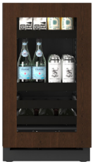
URBV418-IG01A Integrated Frame Glass