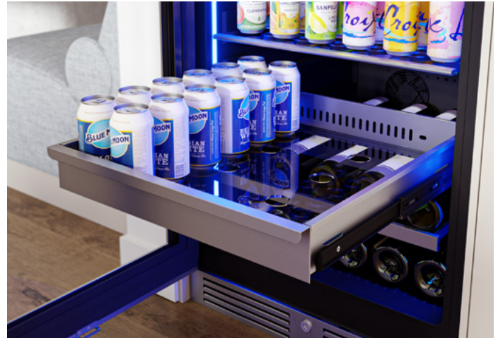
Full-Extension Stainless Steel Rollout Bin with Transparent-Gray Glass