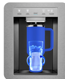
Tall Dispenser Design