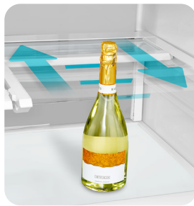
OneTouch Infinite Shelf