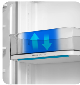
OneTouch Infinite Door Bin