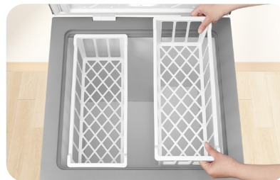
Removable Storage Baskets