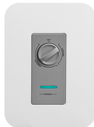
Exterior Control Panel