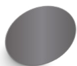
Charcoal Grey MLHE27H7BCG