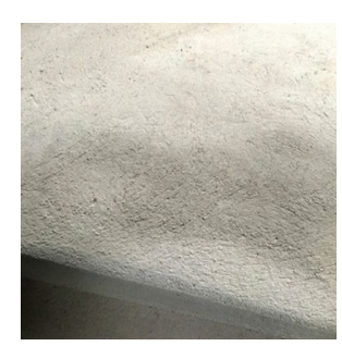
CONCRETE REFRACTORY DOME

The Napoli Outdoor Oven™ is always evolving. That philosophy is reflected in its features. We've refined these features to give you a cooking experience that's both simple and stunning.