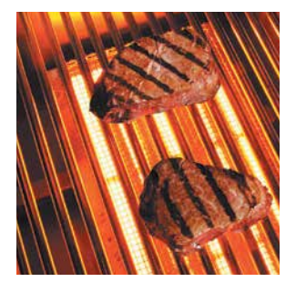
PROSEAR™ INFRARED BURNER

The Sedona by Lynx™ Series is always evolving to be the best at something new. That philosophy is reflected in its features. We've refined these features to give you a grilling experience that's both simple and stunning.