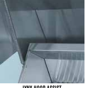
LYNX HOOD ASSIST