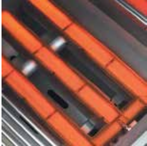
TRIDENT™ INFRARED BURNER

Our unrelenting attention to detail and our passion for innovation have fostered the stunning features that define the Lynx Professional Series. These features begin with meticulous hand-crafted excellence, and they culminate in powerful capabilities that give you precision control.