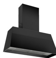
KMC30NE Matt black canopy