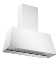
KMC30BI Matt white canopy