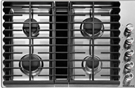
Stainless Steel KCGD500GSS