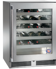
HB24WS4 Wine Reserve