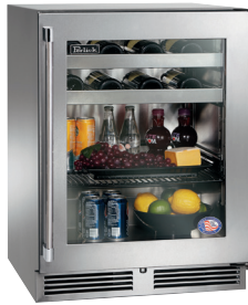
HB24BS4 Beverage Center