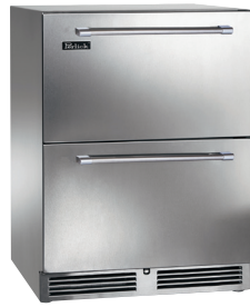
HB24FS4 Freezer Drawers