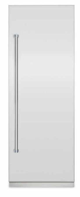
Shown with optional stainless steel door panel kit