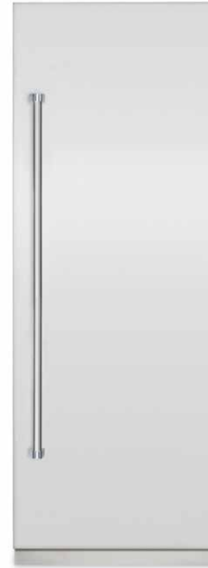
Shown with optional stainless steel door panel kit