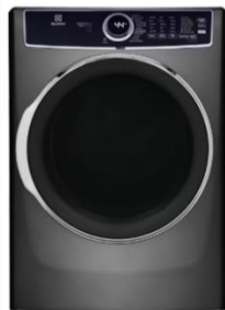
ELFG7637AT 600 Series Gas Dryer