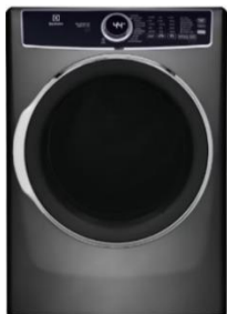
ELFE7637AT 600 Series Electric Dryer