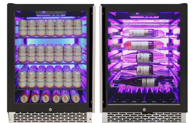
Shown paired with EL-54COMM wine cooler