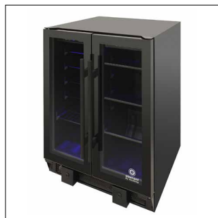
Unit Without Bottles