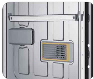
Smart Dry with AutoRelease™ Door

Fingerprint Resistant Navy Steel (panel sold separately)