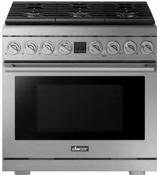
DOP36T86DLS/DA - Silver Stainless, Natural Gas