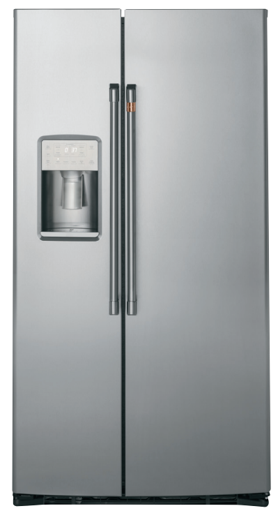
CZS22MP2NS1 Stainless Steel with Brushed Stainless handles