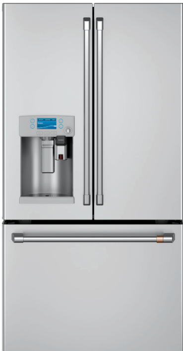
CYE22UP2MS1 Stainless Steel with Brushed Stainless handles