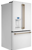
CKLBLSCNW2 Matte White Side Panel (left)