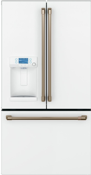
CYE22TP4MW2 Matte White with Brushed Bronze handles