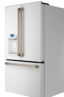
CKLBRSCNW2 Matte White Side Panel (right)