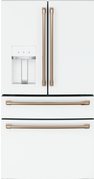
CXE22DP4PW2 Matte White with Brushed Bronze handles