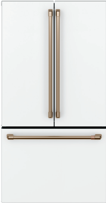
CWE23SP4MW2 Built in Wifi Matte White with Brushed Bronze handles