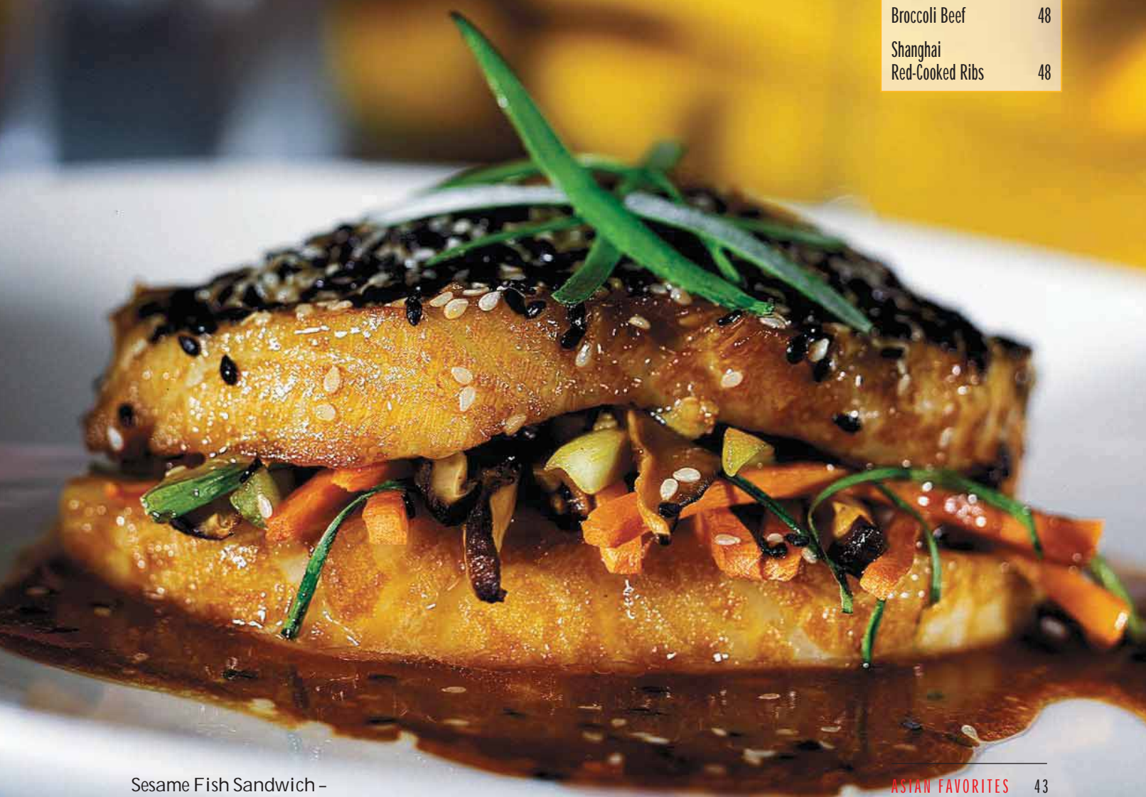
Sesame Fish Sandwich – recipe on page 44