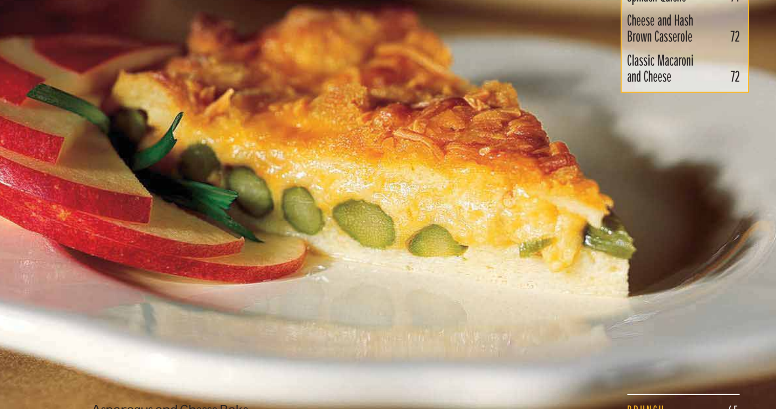
Asparagus and Cheese Bake – recipe page 66