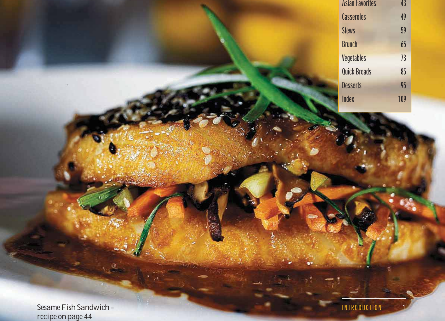
Sesame Fish Sandwich – recipe on page 44