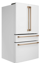
CKQBLSFNW2 Matte White Side Panel (left)