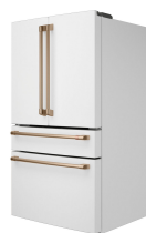
CKQBRSFNW2 Matte White Side Panel (right)