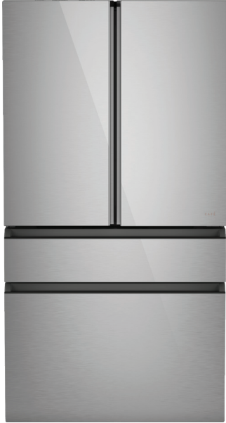
CGE29DM5TS5 Platinum Glass with Integrated Pockets