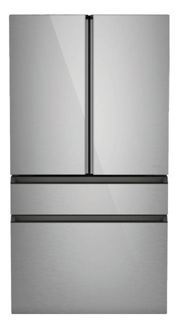
CGE29DM5TS5 Platinum Glass with Integrated Pockets