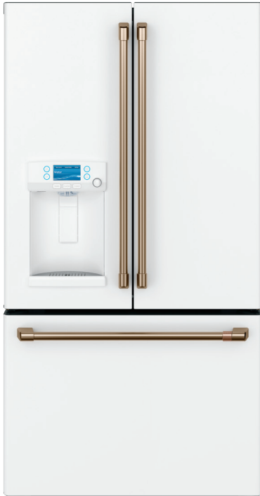
CFE28TP4MW2 Matte White with Brushed Bronze handles