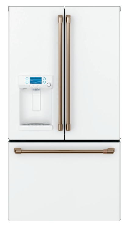
ALSO AVAILABLE IN